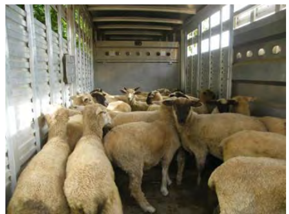
My brother's lambs in the corral, sorted and loaded for the local sheep and lamb pool. Center photo is group of ewe lambs, not leaving. I use this pool for extra market lambs, usually in June or July. JoAnn Mast