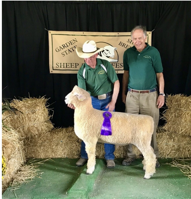
Anchorage Farm 1495 17Tw 2017 ARBA National Champion White Ewe