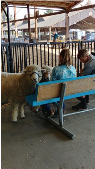
Waiting to show....

Fairs were hard to come by this year, but the Oregon State Fair was super. Great to see everyone. We had open class white and NC shows. The Oregon Romney Breeders Assn sponsors a Romney wool show for open and junior, beautiful fleeces. I am back on the Board after being off a few years. Please let me know if anyone has questions or ideas for ARBA, I am happy to discuss.