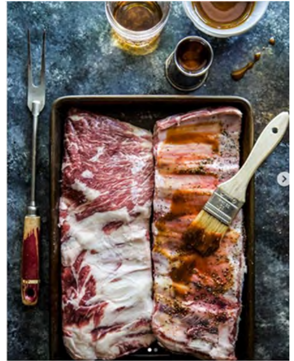
Just a hint for Grilling season from Fan o Lamb