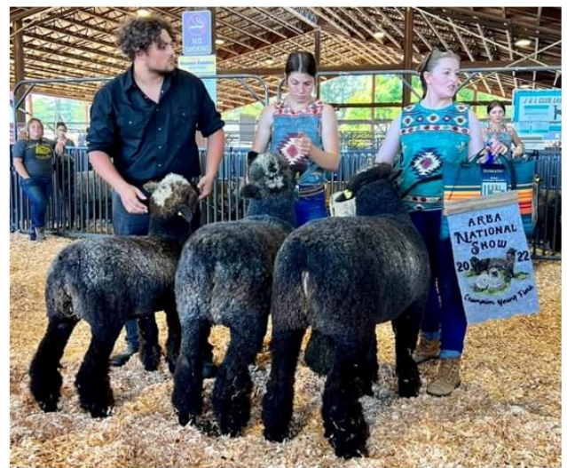
First place NC Young Flock