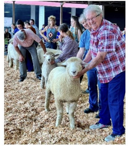
Always fun showing Romneys!