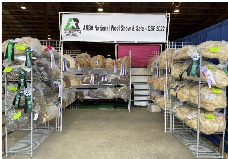
National Wool Show Display