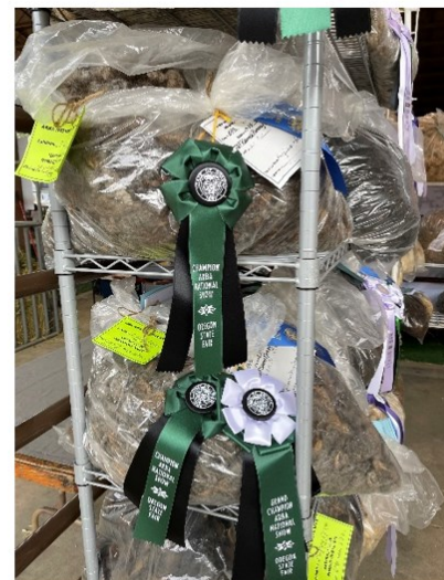
Champions in NC Division