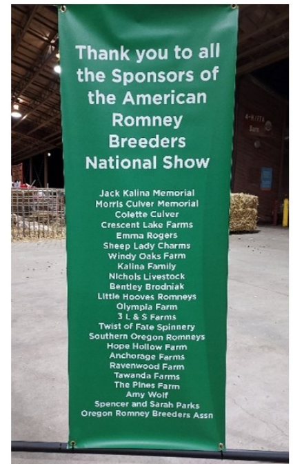
Sponsor List – Thank you!!!