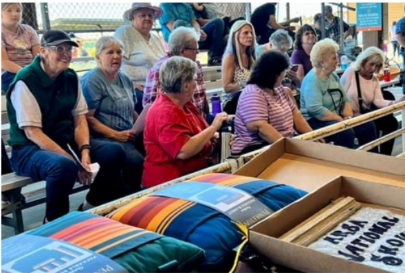
The crowd enjoying the show.