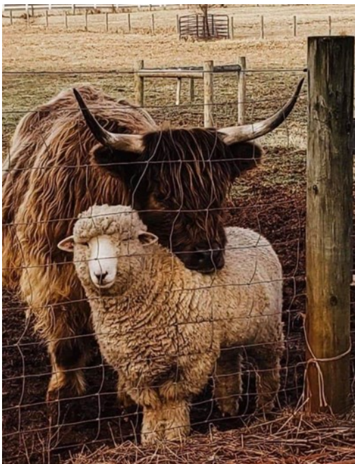
Snuggle weather - Budding Creek Farm, MD

Wishing you all a happy and prosperous 2024 with healthy, fast-growing lambs!