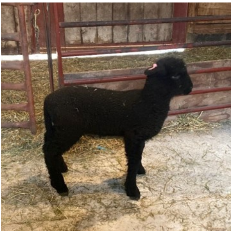
Ewe 1952-24 Tw Extension-dominant