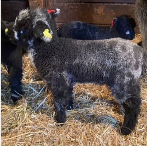
Ram 1917-24 Tw dark blue