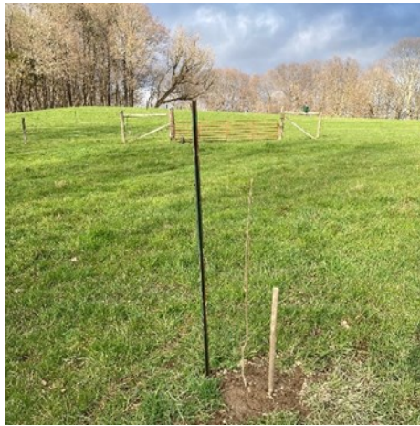
chestnut oak seedling