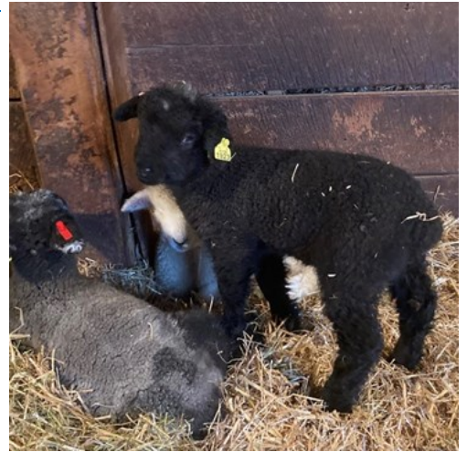
Ewe 1923-24 Tw very dark blue