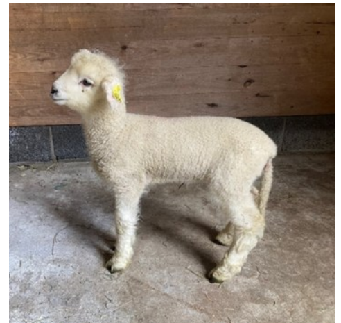
Ewe 1954-24 BW Tw white

Breeding stock available. See the "for sale" tab on our website.